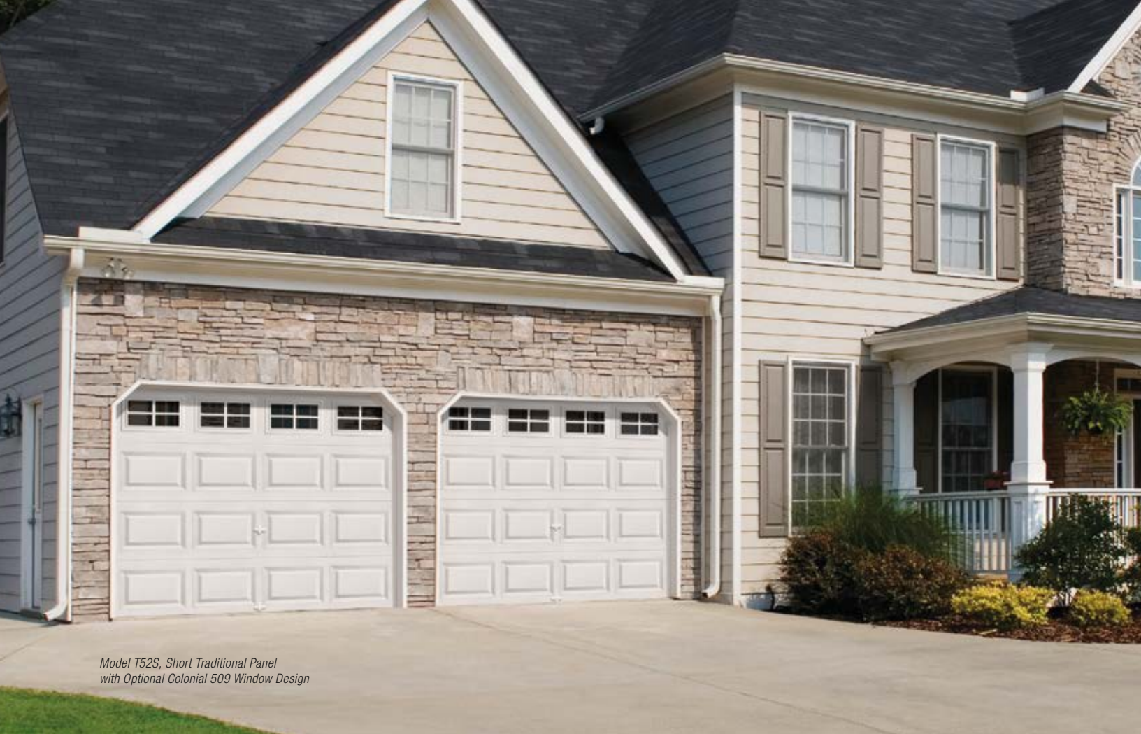
Model T52S, Short Traditional Panel with Optional Colonial 509 Window Design